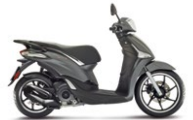
GRIGIO TITANIO OPACO