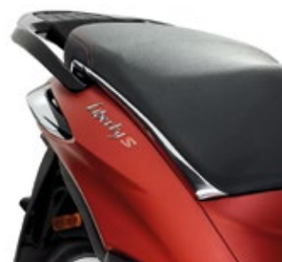
BLACK REAR GRAB HANDLE