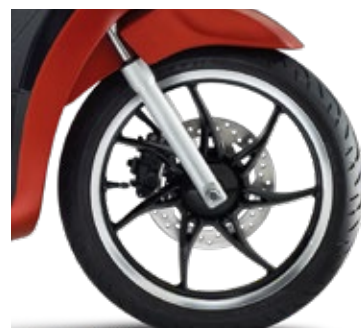
BLACK DIAMOND WHEEL RIMS