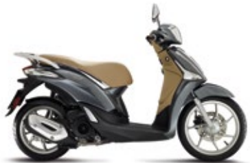
GRIGIO TITANIO LUCIDO

Liberty S 50 i-get | 125 i-get ABS | 150 i-get ABS