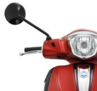
BLACK REAR VIEW MIRRORS